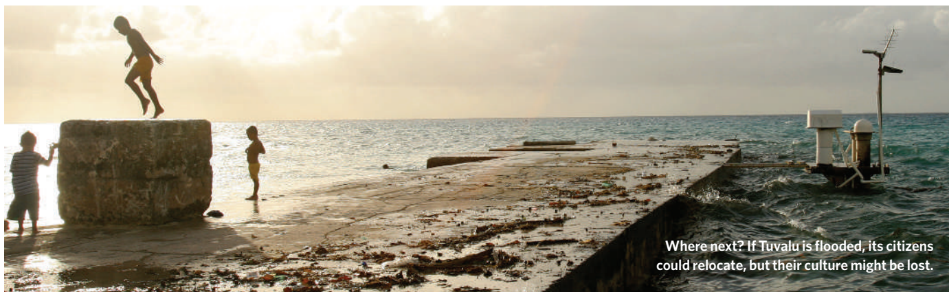
S. S. PATEL

Where next? If Tuvalu is flooded, its citizens could relocate, but their culture might be lost.