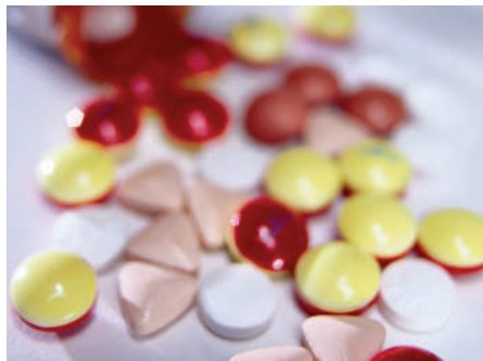
Bitter pill? Meta-analyses funded by drug companies are more likely to be positive.

executive of the London-based healthcare company UnitedHealth Europe and a former editor of the British Medical Journal ( BMJ ).